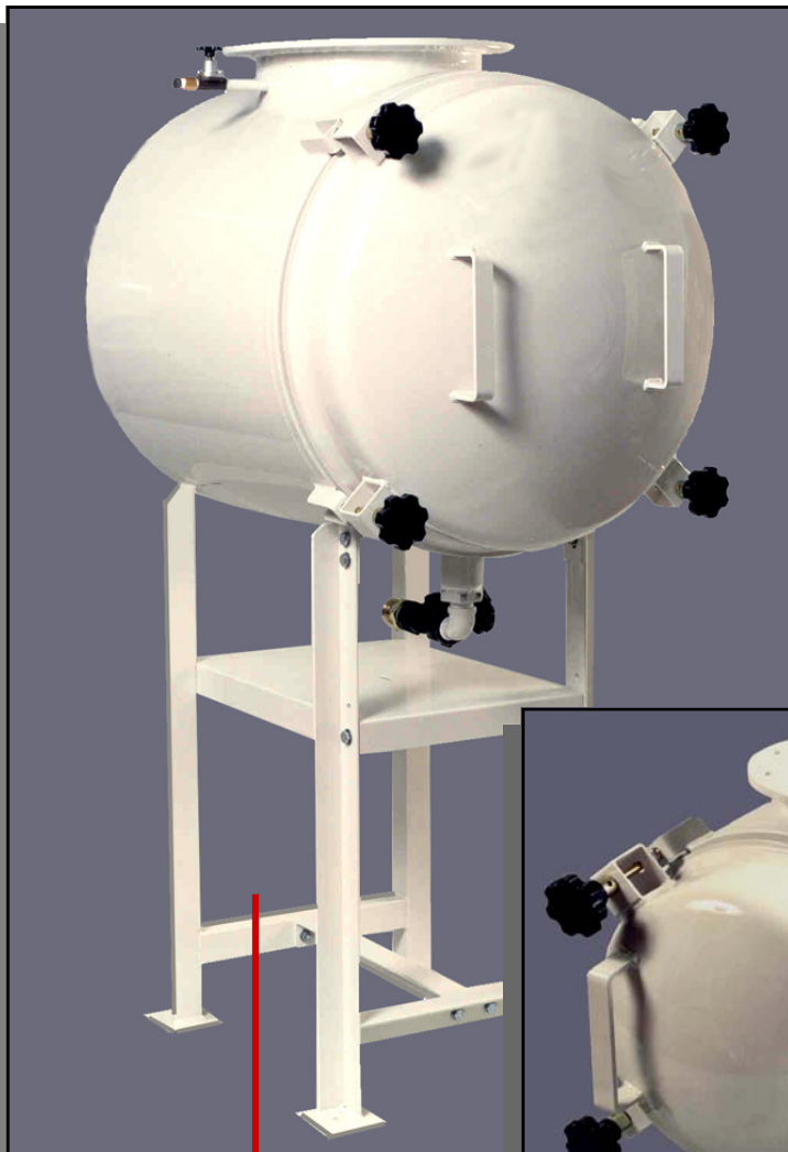
950 l/s Cylindrical Housing with rear entry, top exit configuration

Designed to meet the performance requirements of NF 0153/1