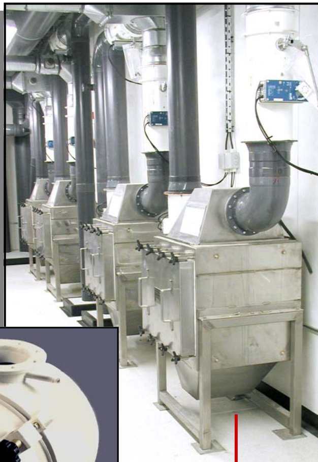
Rectangular Housings 470/850 l/s